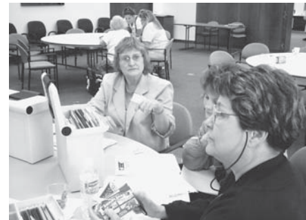
St. James, Sewickley

Participating school teams develop plans for grade appropriate activities related to the Lewis and Clark Commemoration.