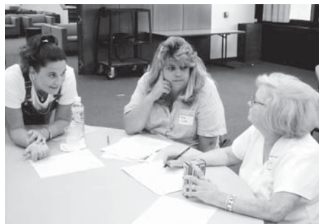
Holy Spirit School