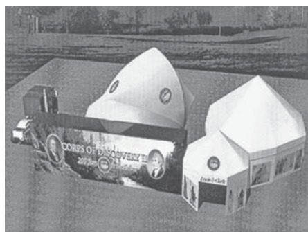
Corps of Discovery II exhibit area

For further information contact the Lewis & Clark National Historic Trail, National Park Service, 1709 Jackson St., Omaha NE 68112; call 402-514-9311; or www.nps.gov/lecl .